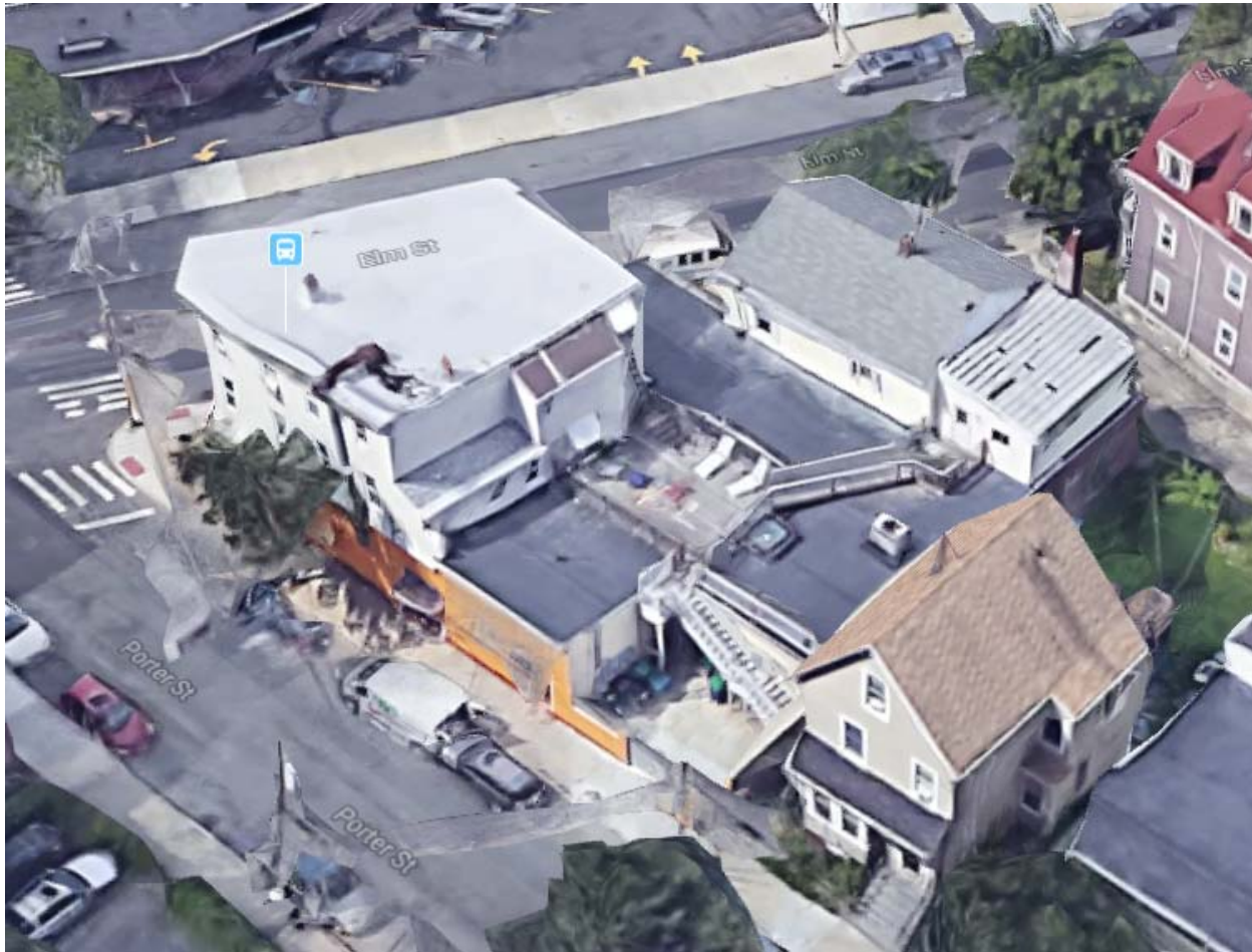
Aerial view of Porter and Elm Street properties showing the numerous single story additions with emergency egress over the roofs.